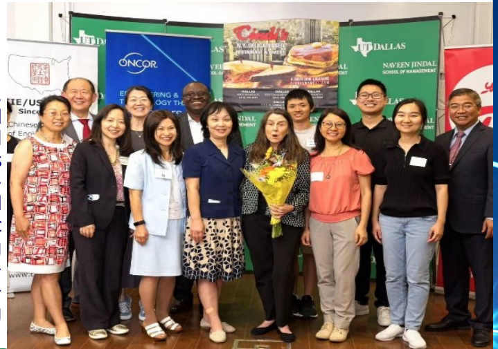
Picture : Winners and award presenters